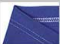
2 Needle Wide