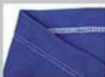
2 Needle Narrow